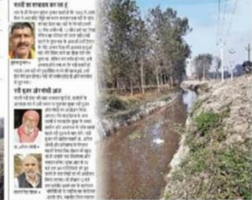
जिस जमीन में 145 बीघा की जमीन का बोझल के टीला पर ही रुक गिरी काली नदी डूब रही जलपट्टा, किसानों ने छोड़ी 145 बीघा जमीन जिंदा हो रही नदी।